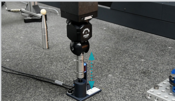
3. The stylus moves up and down through the cleaning unit for 20 seconds