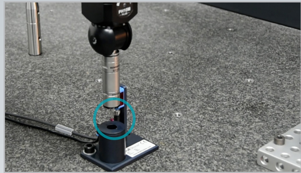
2. As soon as the stylus is above the cleaning unit, the stylus can be cleaned