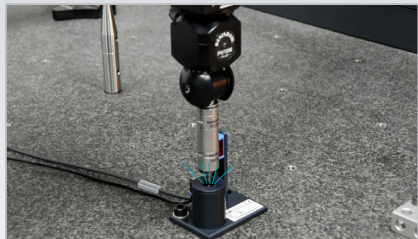
4. The stylus is cleaned by the use of compressed air